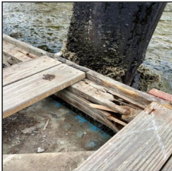
August 24, 2021 Site Inspection: Timber framing is broken at pile guide connection at East dock Pile 2