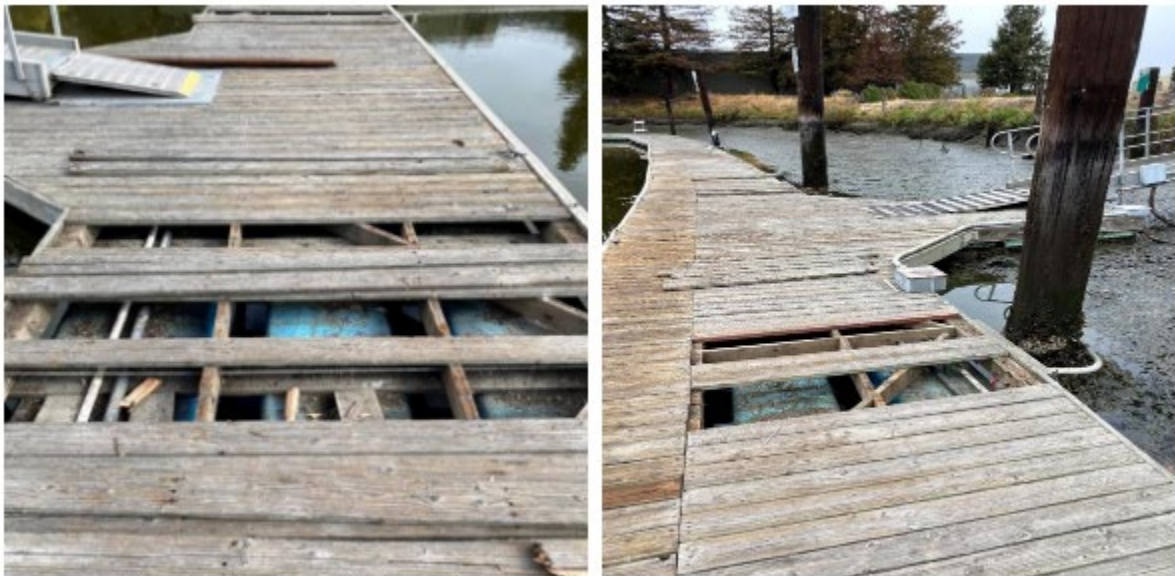
Figure 1: Petaluma River Turning Basin Timber Floating Docks Removed October 2022