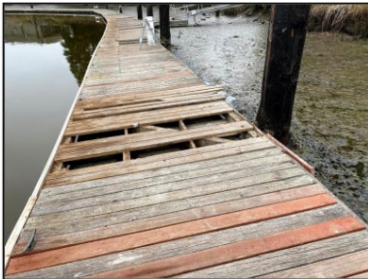
August 24, 2021 Site Inspection: East dock at Pile 2 looking north.