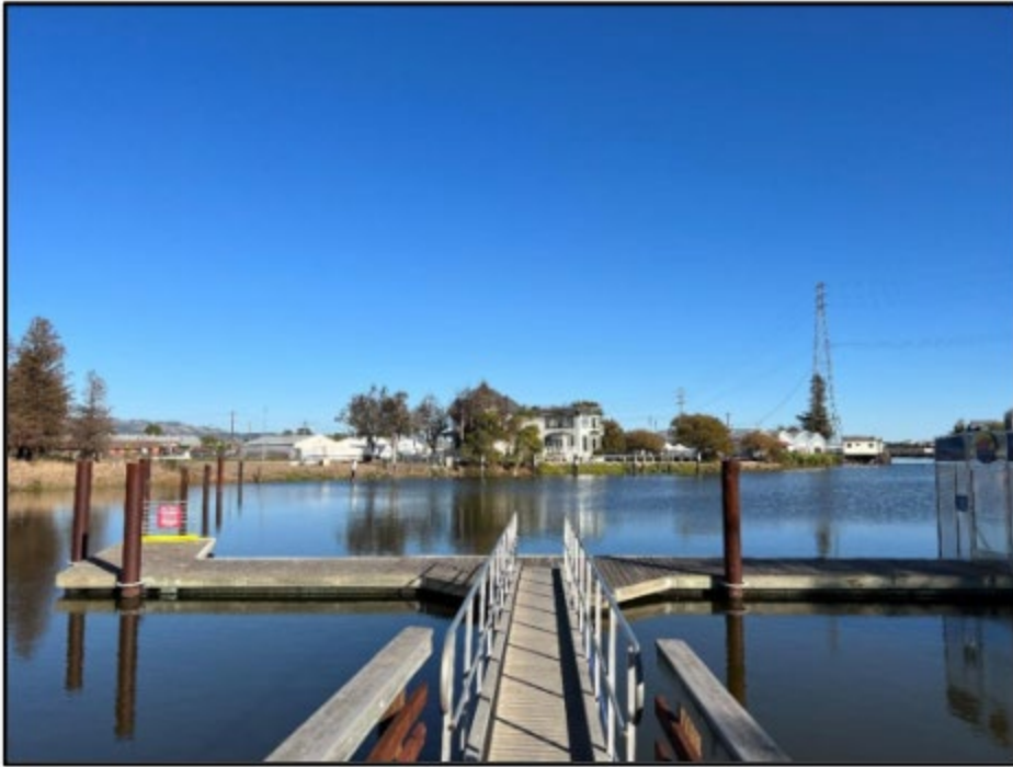
On site conditions October 27, 2022